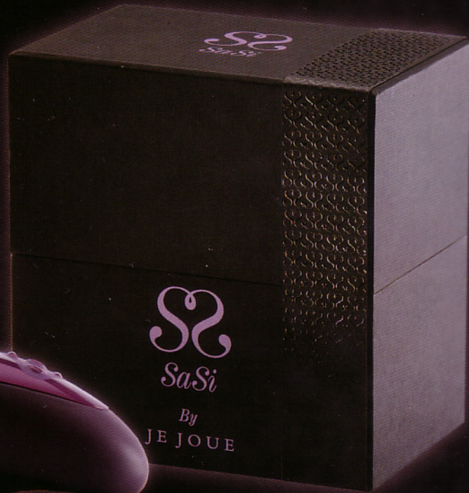
"SaSi's" nub gives the closest sensation to the tip of a tongue